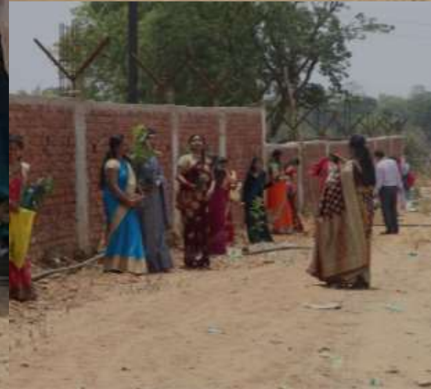
PLANTATION DRIVE IN NSU AND ADOPTED VILLAGE MUKHIYA DANGA ON 17 JUNE 2023